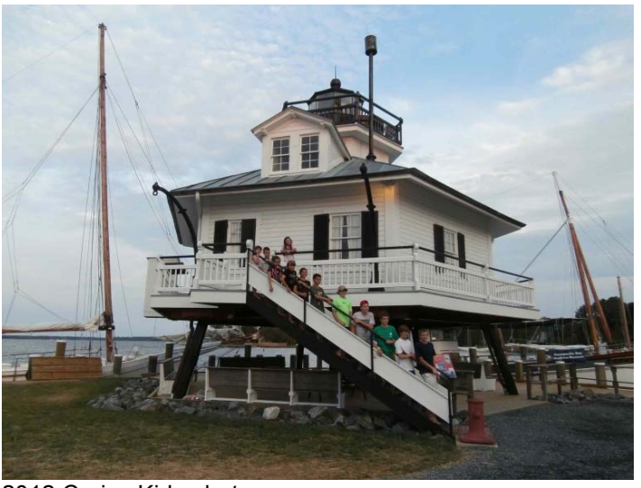
2012 Cruise Kids photo.

You can see that there were 12 youngsters on this year's cruise.