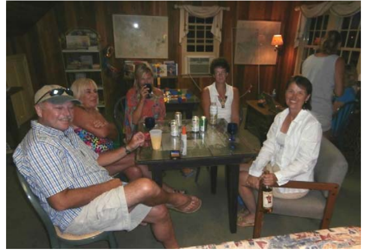
Our party in the meeting room at the Sailing Emporium.

On Friday, we motored across the Bay to Annapolis.