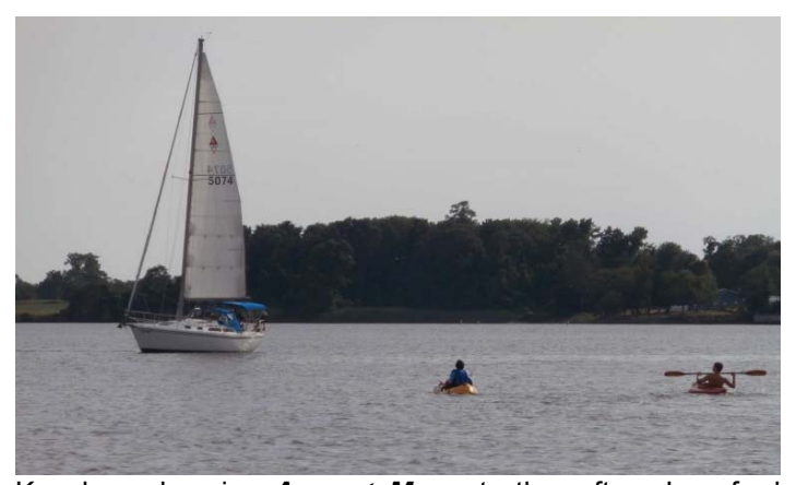
Kayaks welcoming August Moon to the raft on Langford Creek.