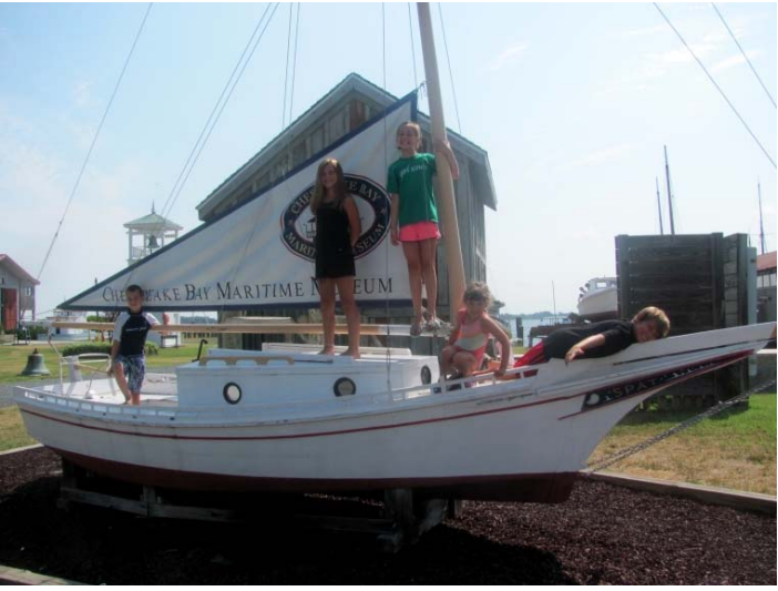
Some of our fleet's kids posing at the museum.