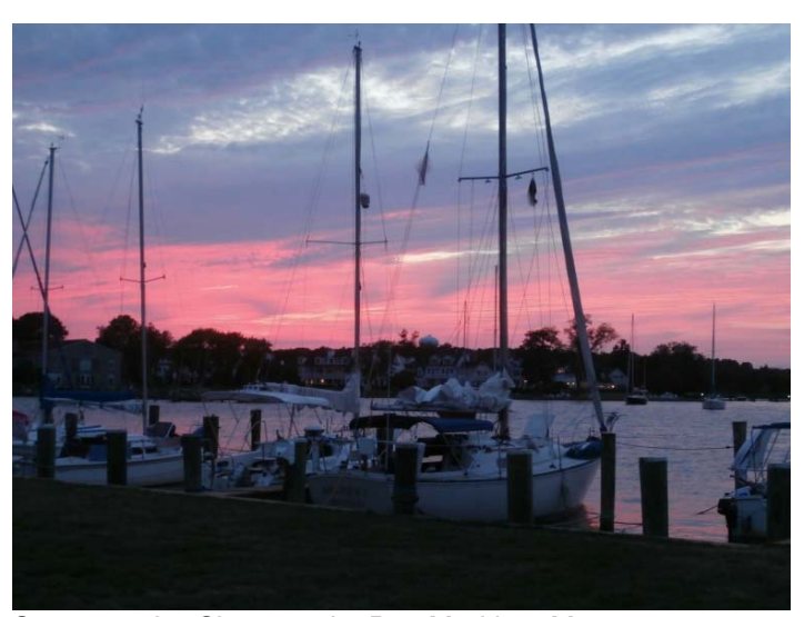
Sunset at the Chesapeake Bay Maritime Museum.