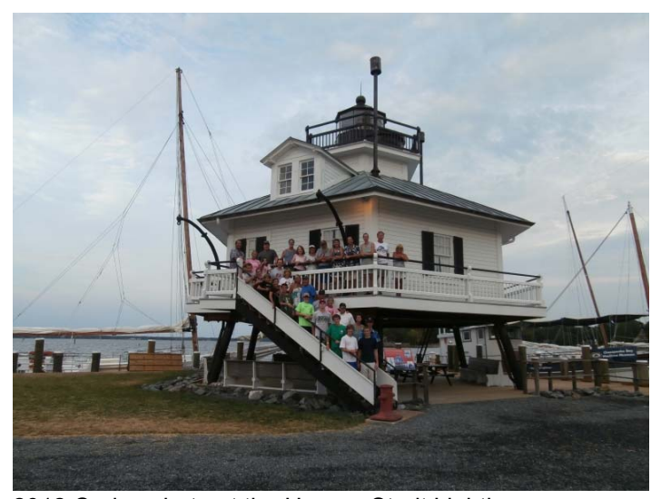
2012 Cruise photo at the Hooper Strait Lighthouse.