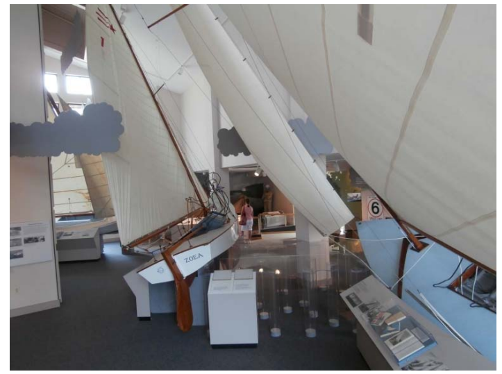
Some of the museum's sailing exhibits.

You can see that there were 12 youngsters on this year's cruise.