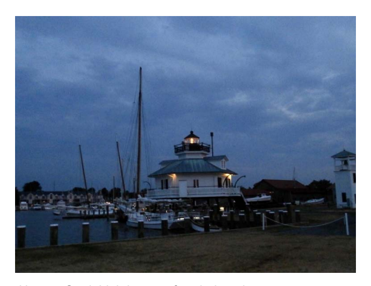
Hooper Strait Lighthouse after dark at the museum.